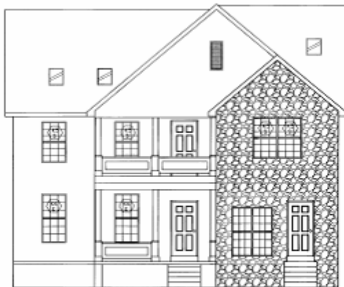
FRONT ELEVATION SCALE 1/4" = 1'

1453 North Star Road Residential – 3 units